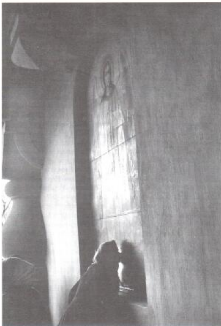
A woman kisses the Virgin Mary in Zagorsk.