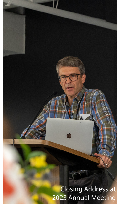
Closing Address at 2023 Annual Meeting

There are now 1,000,000 students on campuses with Christian Study Centers, and another 15,000,000 on campuses without centers.