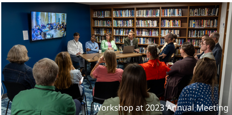
Workshop at 2023 Annual Meeting