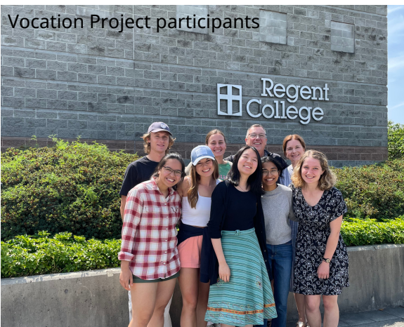
Vocation Project participants