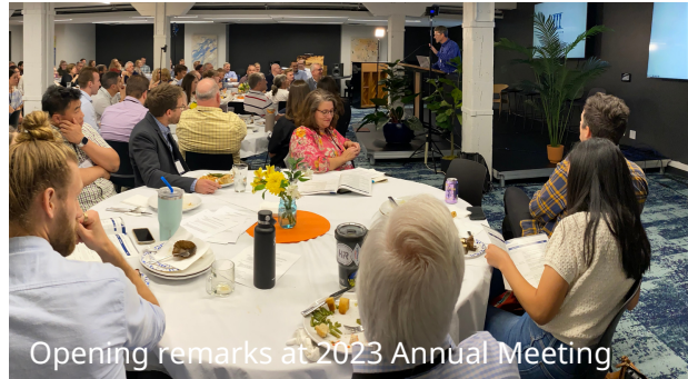
Opening remarks at 2023 Annual Meeting